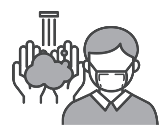
[Guideline 1] Always wear a mask (KF80, KF94) wherever you are. Wash your hands frequently.

Important Guidelines for COVID-19 Safety (Essential Protection Measures against COVID-19 Variants)